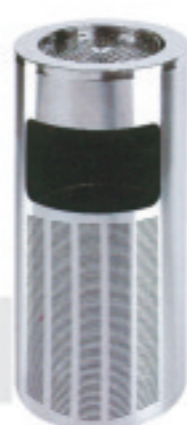
不锈钢垃圾筒 Stainless dustbin