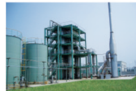
垃圾焚烧厂 Waste calcinations plant