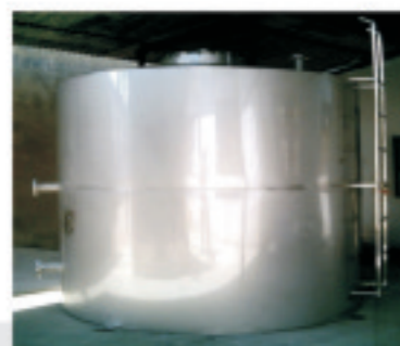
不锈钢储液罐 Stainless steel liquid storage tank