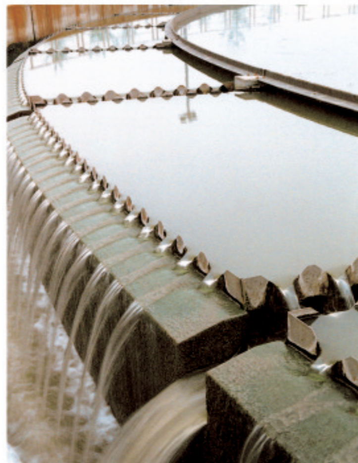
污水处理 Sewage treatment plant