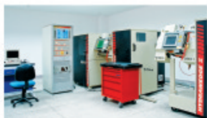
热模拟试验机 Thermal Simulating Tester