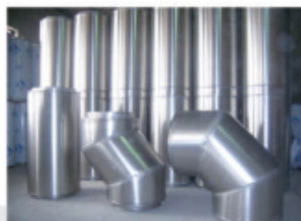
不锈钢烟囱 Stainless steel chimney