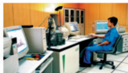
扫描电镜 Scanning Electron Microscope