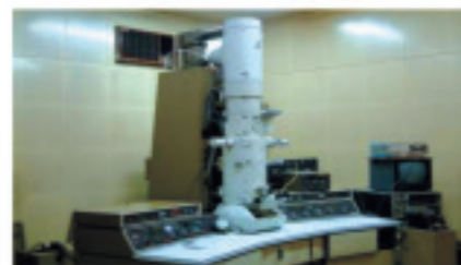
透射电镜 Transition Electron Microscope