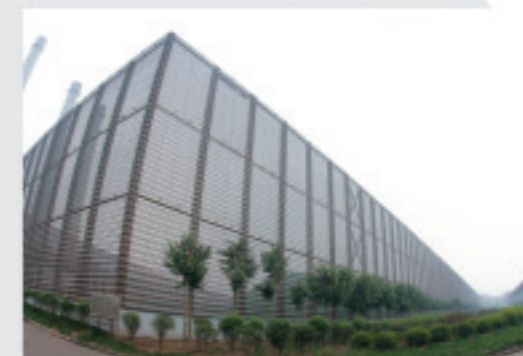
不锈钢防尘网 Stainless steel dust shielding screen